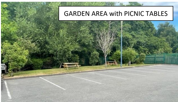
GARDEN AREA with PICNIC TABLES