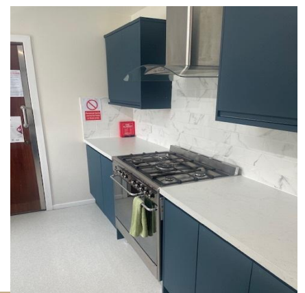
NEW FULLY STOCKED KITCHEN AREA